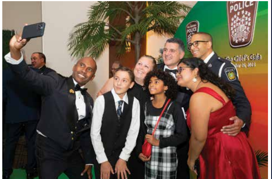
The 2nd Annual Peel Regional Police Chief's Gala was an evening of celebration, entertainment and generous support for ProAction's Peel Chapter!